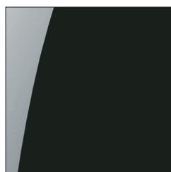
Black High Gloss