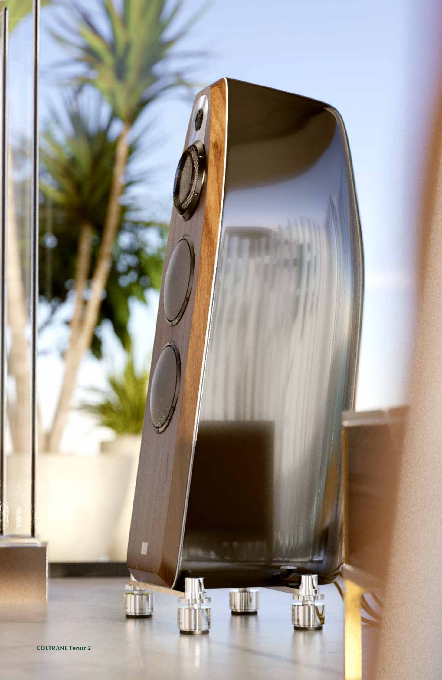
COLTRANE Tenor 2